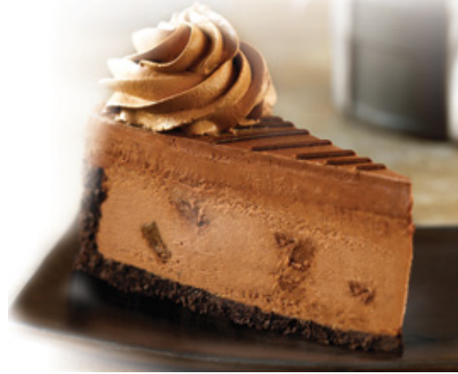
GODIVA® Double Chocolate Cheesecake

Our desserts are simply exquisite! Indulge yourself in one of our sweet sensations